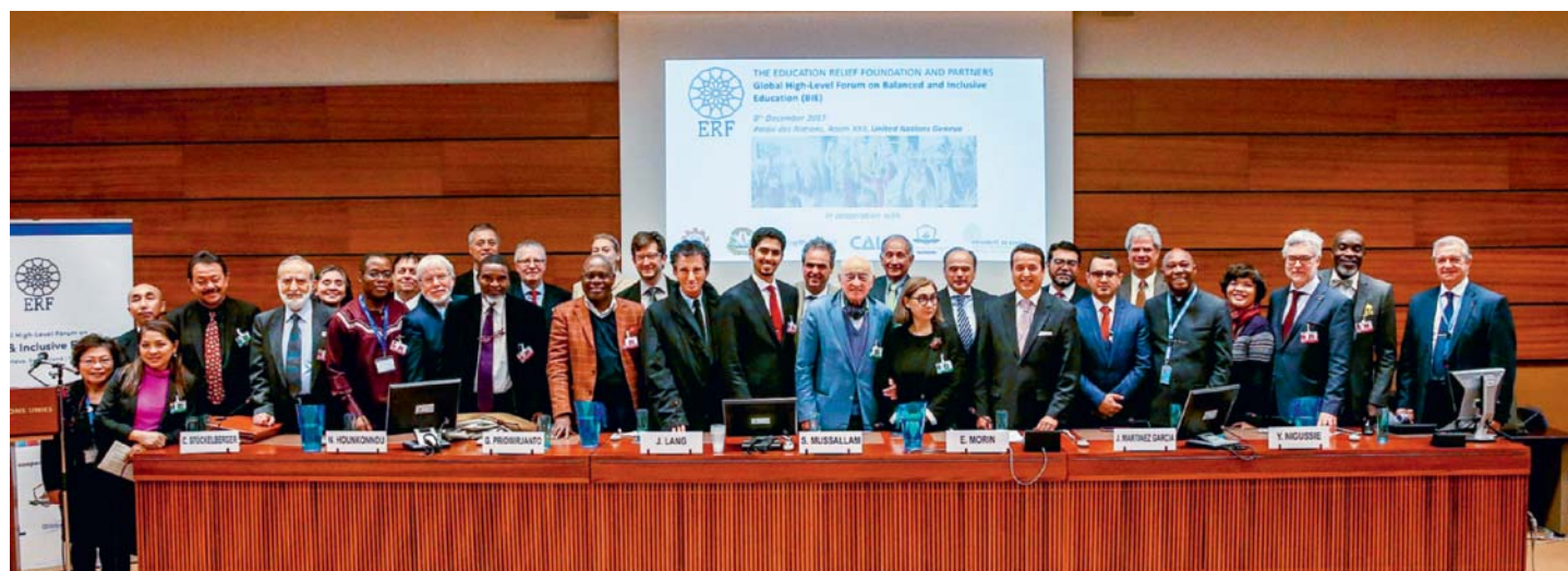
Global Stakeholder Forum with leaders and experts in education. United Nations Geneva, 8 December 2017.